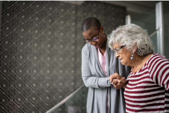
National Family Caregiver Month

30 St. Andrew's Day , the feast day for St. Andrew within various Christian denominations.