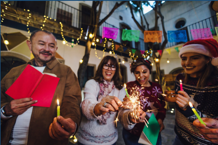
Hispanic Heritage Month