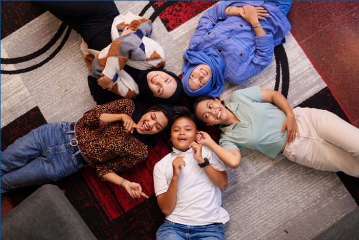
International Day of Friendship