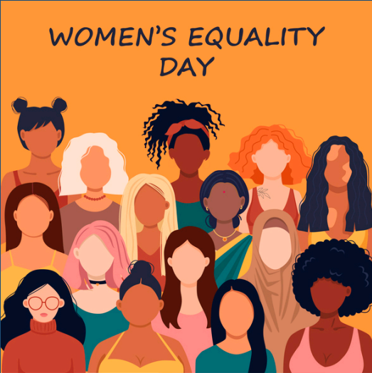
Women's Equality Day