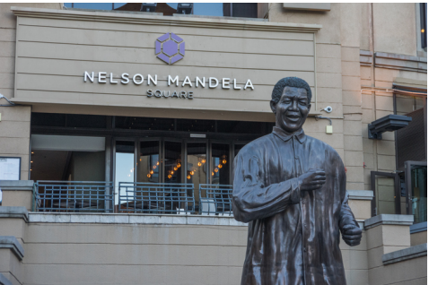
Nelson Mandela International Day