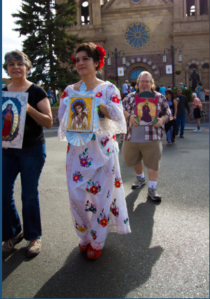
Feast of Our Lady of Guadalupe