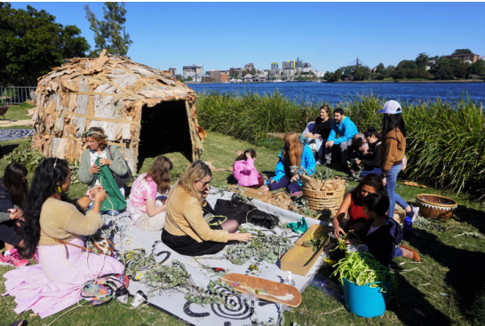
First Nations Day

30 Armed Forces Day , a holiday in Guatemala commemorating the overthrow of former President Vicente Cerna y Cerna by the Liberal Revolution.