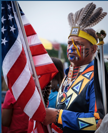
National Native American Heritage Month