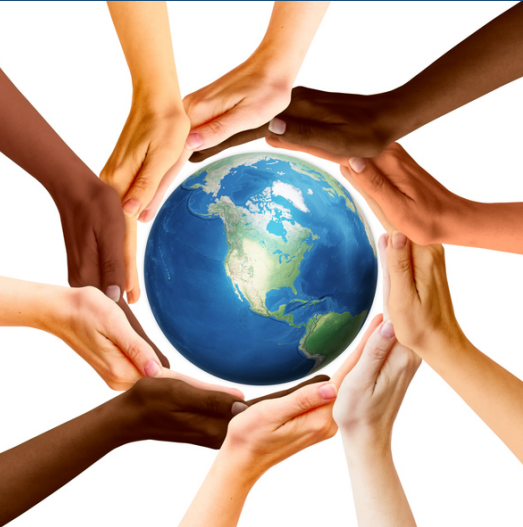
World Humanitarian Day