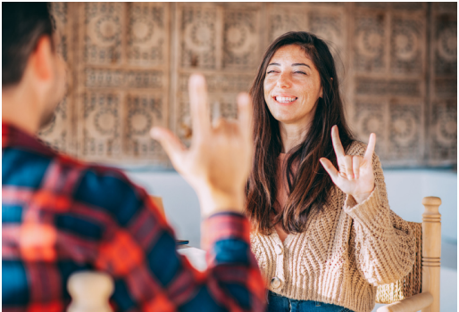
International Day of Sign Languages

30 National Day for Truth and Reconciliation , a Canadian holiday honoring the Indigenous children who never returned home and survivors of residential schools, as well as their families and communities.