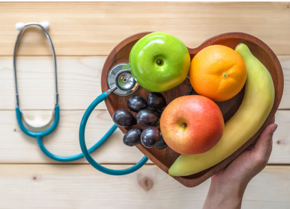
National Wellness Month

29 Beheading of St. John the Baptist , a holy day observed by various Christian churches that commemorates the martyrdom of St. John the Baptist.