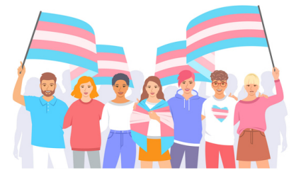
Transgender Day of Visibility March 31

31 International Transgender Day of Visibility , celebrated to bring awareness to transgender people and their identities and recognize those who helped fight for rights for transgender people.