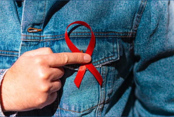
World AIDS Day