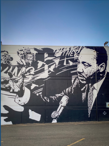
Martin Luther King Jr. Day