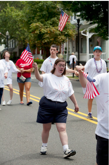
Disability Independence Day

30 International Day of Friendship, proclaimed in 2011 by the UN General Assembly with the idea that friendship between peoples, countries, cultures, and individuals can inspire peace efforts and build bridges between communities.